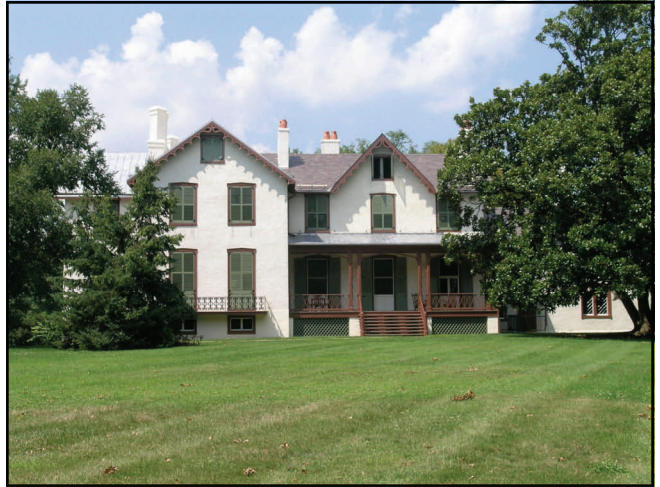
President Lincoln's Cottage, National Trust Historic Site