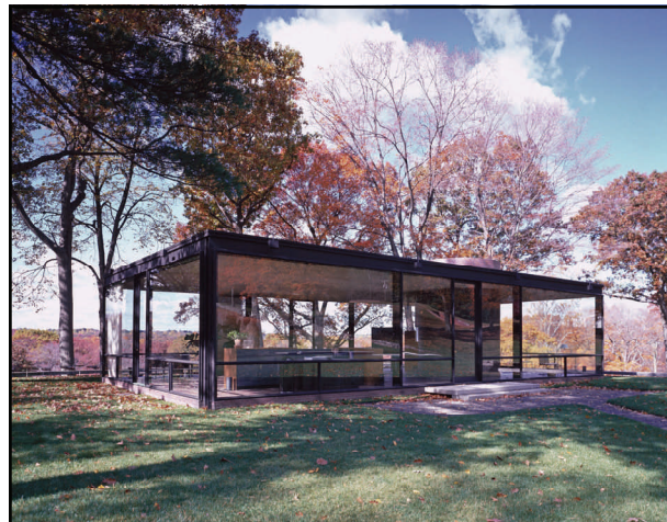
Glass House, National Trust Historic Site

The National Trust for Historic Preservation announces the creation of Heritage Travel, Inc., a new initiative designed as the definitive place for travelers to discover the breadth of heritage and cultural travel opportunities.