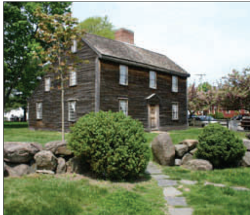
John Adams birthplace

The National Park Service has launched a new on-line travel itinerary on the American Presidents. The American Presidents itinerary is the 47th in the National Park Service's ongoing Discover Our Shared Heritage Travel Itinerary Series. The series promotes public awareness of history and encourages visits to historic places throughout the country.