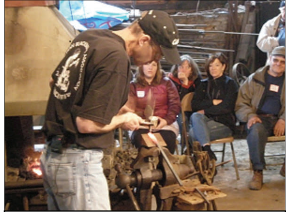
Visitors at a previous Hammer-In watch a blacksmith demonstration.

The machine shop was described by an expert of the Smithsonian Institute as "one of the most rare and unique historic machine facilities in the United States."