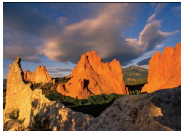
Garden of the Gods Park is a National Natural Landmark.

To view the entire list of Destinations visit the website at http://www.preservationnation.org/travel-and-sites/travel/dozen-distinctive-destinations/ .